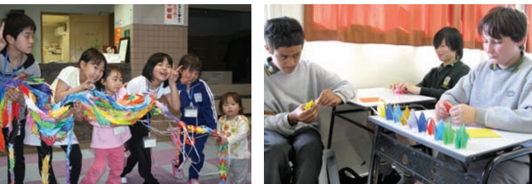
Students made 1000 paper cranes for Japan in two weeks. Their efforts brought smiles to children at an accommodation centre supervised by their friends from Shinagawa.

Friendship with schools in other parts of the world is an important aspect of life at Lynfield College. The school alternates visits with Germany, Japan and China on a yearly basis. By both hosting and travelling, students broaden their understanding and appreciation of other cultures.